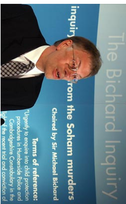
The tragic Soham murders 6 years ago prompted the new body

How will it work? You will be assessed using data gathered by the Criminal Records Bureau (CRB); this will include relevant criminal convictions, cautions, police intelligence and information referred to the ISA from other sources such as employers and professional bodies.